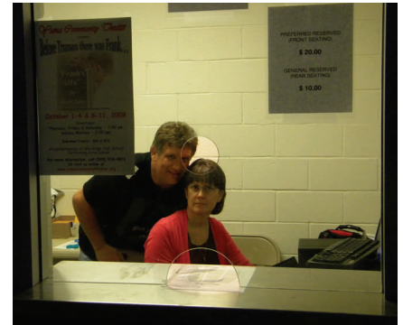
Our friendly ticket agents are ready to serve you.

As always, tickets will be sold at the door the night of the performances.